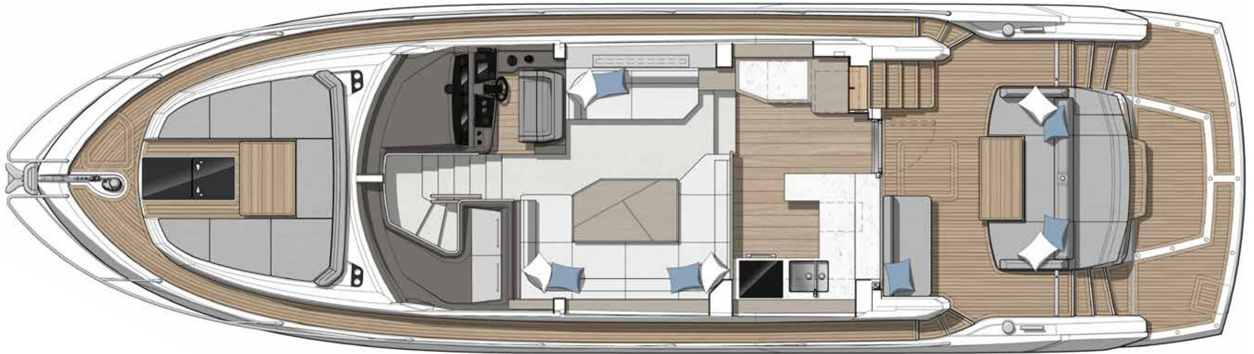
MAIN DECK - SALOON OPTION